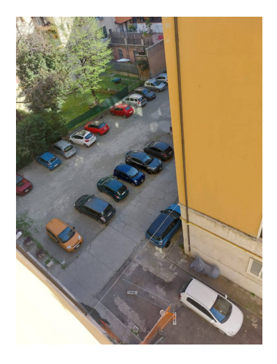
Piano 4° - H = 3,23 ml