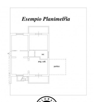
COLDWELL BANKER PER MOTIVI DI PRIVACY LE PLANIMETRIE SONO CONSULTABILI SOLO SU RICHIESTA