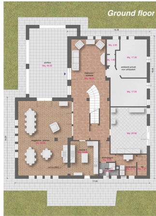
PIANO TERRA scala 1:100