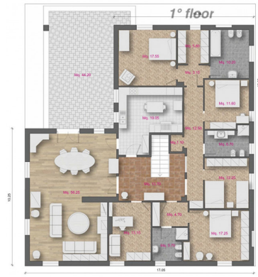
PIANO PRIMO scala 1:100