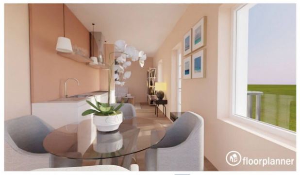
G COLDWELL BANKER