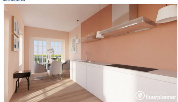
G COLDWELL BANKER