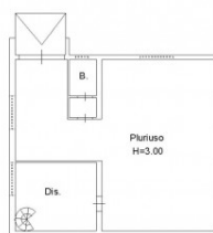
Pianta piano seminterato