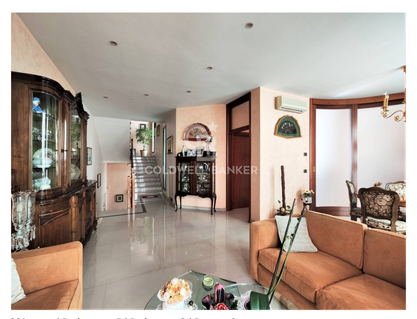
331 sq.m. | Bathrooms: 5 | Bedrooms: 3 | Rooms: 6