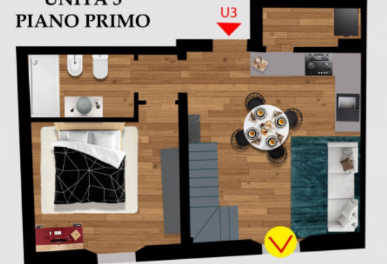
Immagine al solo scopo illustrativo